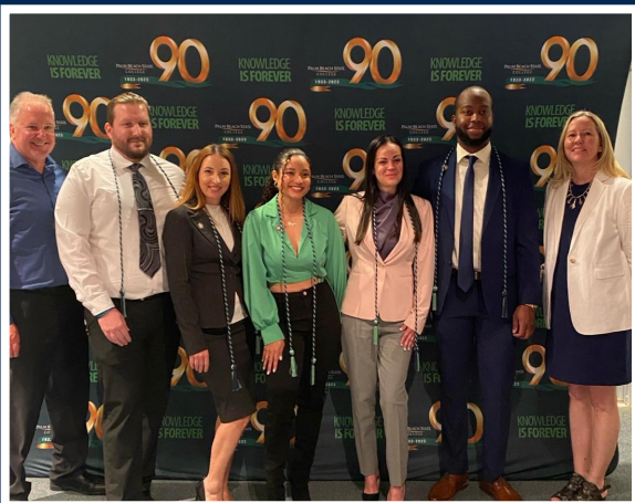
Palm Beach State College 2024 Lambda Beta Inductees

Want to start your own chapter? Click here for more information.